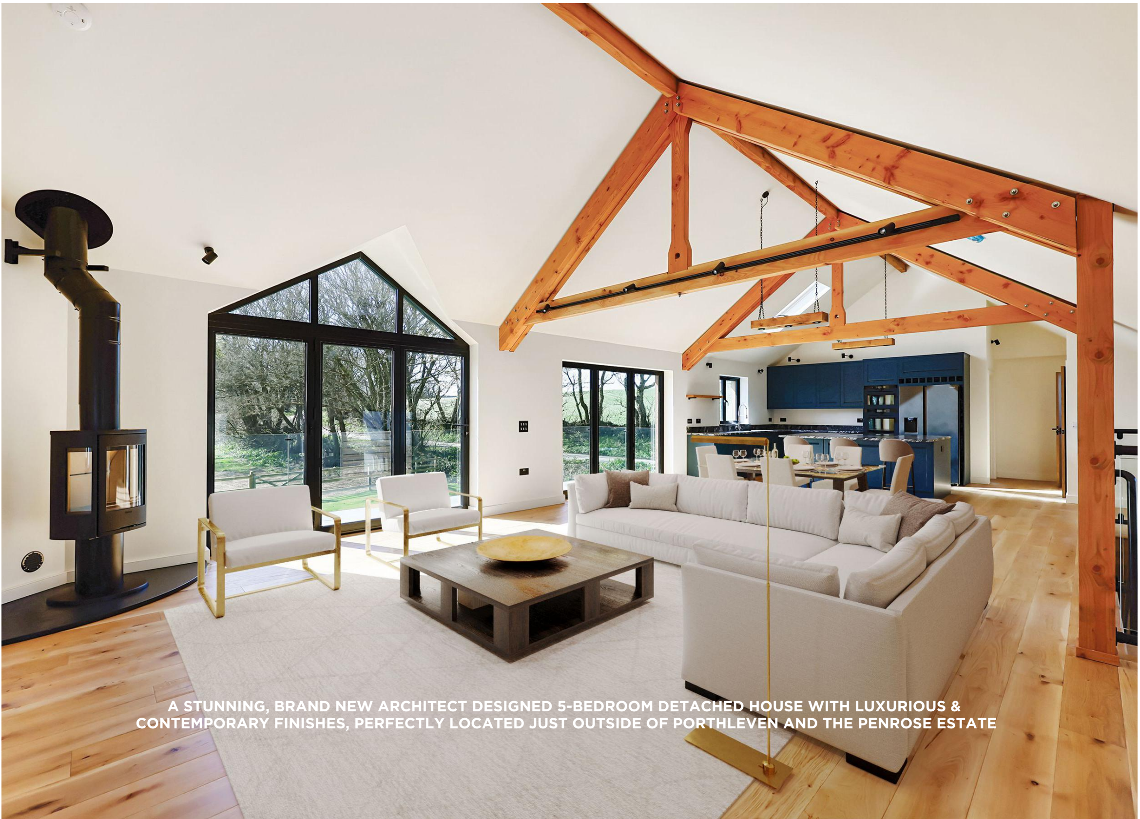
A STUNNING, BRAND NEW ARCHITECT DESIGNED 5-BEDROOM DETACHED HOUSE WITH LUXURIOUS & CONTEMPORARY FINISHES, PERFECTLY LOCATED JUST OUTSIDE OF PORTHLEVEN AND THE PENROSE ESTATE